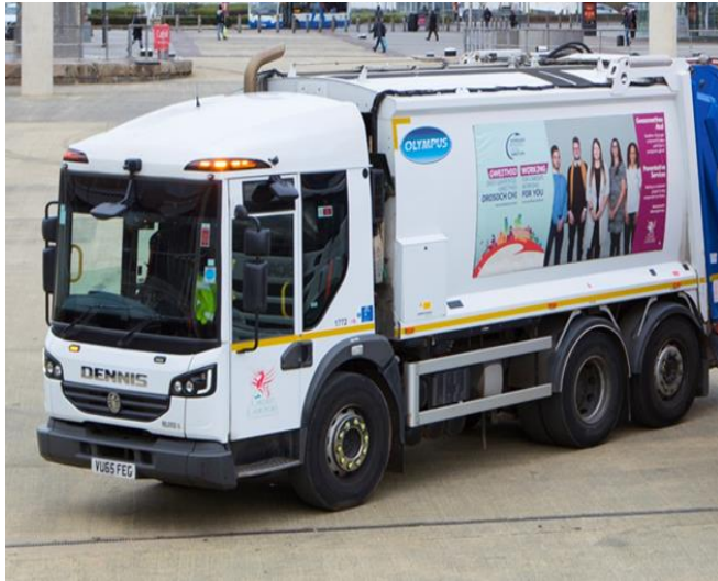
Waste Collection Vehicle